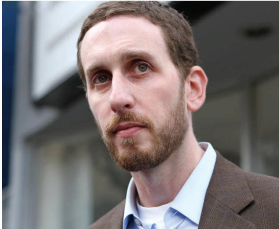
Sen. Scott Wiener

"The housing crisis is not just about it being hard for people today to find housing — that is a huge problem, and the housing crisis fuels evictions, displacement and makes it hard for families to grow," he said. "But the housing crisis is also threatening our economic growth in California. If an employer believes its workers will not be able to find housing near the workplace, that employer is going to decide to locate elsewhere or to grow its workforce in another state."